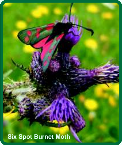
Six Spot Burnet Moth

Despite efforts to drain the marshy lands of The Murrough over many years these low lying areas remain wet, supporting breeding species such as Lapwing and Snipe and providing feeding areas for winter visitors such as Whooper Swans, Curlew and Brent Geese. Hares are often seen here during the summer months and Otters and Grey Heron use the drainage ditches and channels to forage in for the Common Frog. Species such as Ragged Robin, Silverweed, Ladies Smock, Meadowsweet and a variety of colourful orchids are found in these areas.