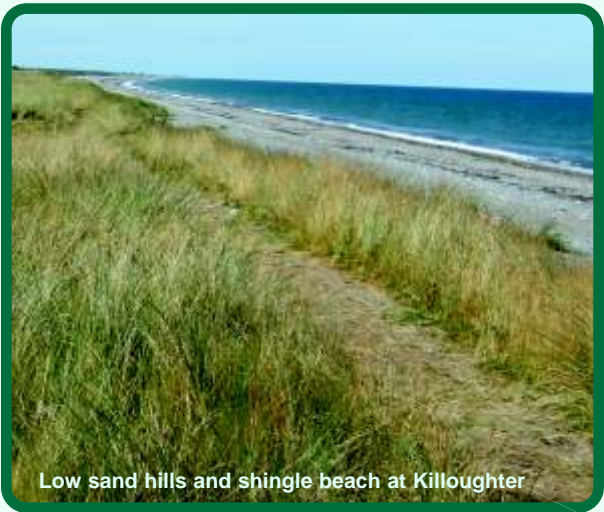
Low sand hills and shingle beach at Killougher